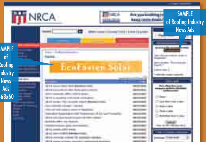
SAMPLE of Roofing Industry News Ads