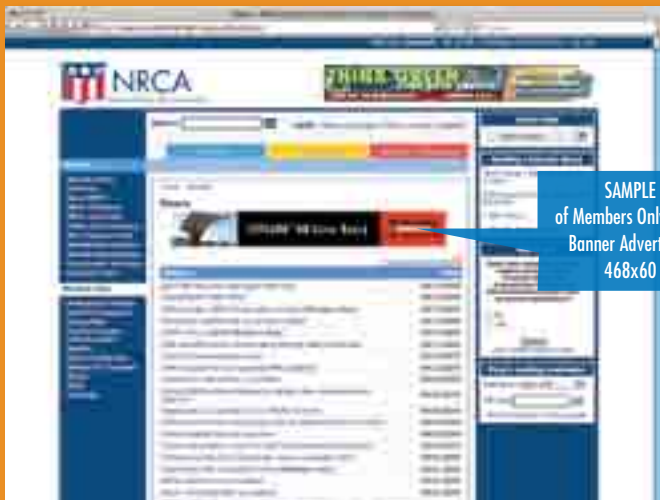
SAMPLE of Members Only News Banner Advertising 468x60

NRCA's website, www.nrca.net, is referenced daily by building owners, homeowners, specifiers and contractors. The site features up-to-date roofing industry news, search options, an enhanced government relations section, NRCA publications and DVDs and a searchable database of contractors. NRCA's website gives your company maximum exposure to numerous markets.