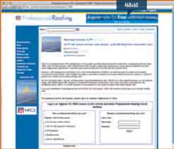
SAMPLE of Full Banner Ad 468x60