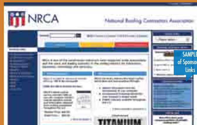
SAMPLE of Sponsored Links