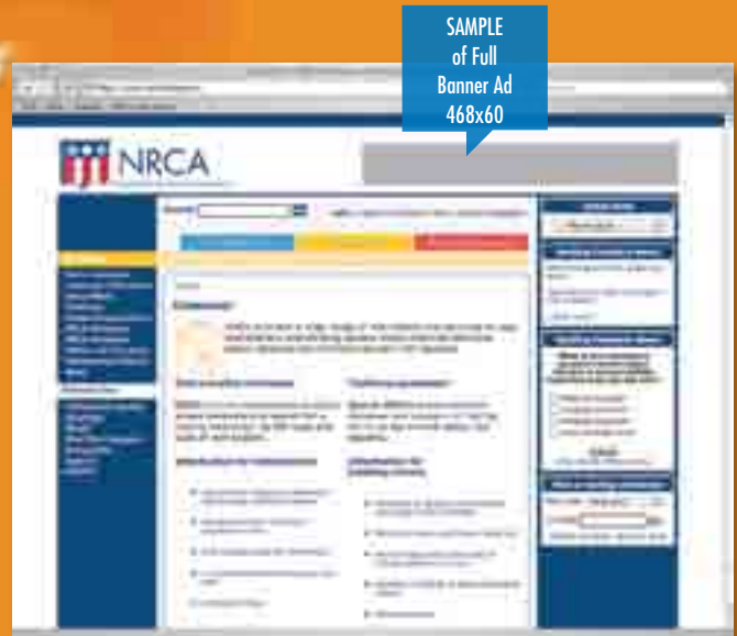
SAMPLE of Full Banner Ad 468x60