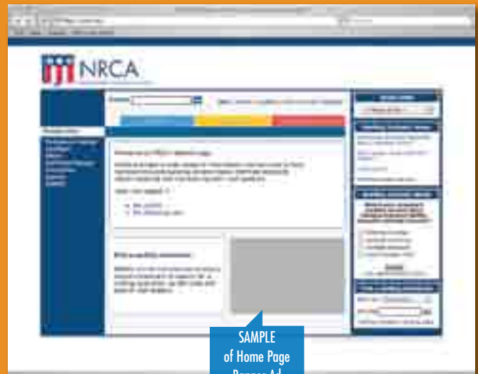
SAMPLE of Home Page Banner Ad 263x175

A home-page banner ad will appear solely on NRCA's home page, www.nrca.net, and will include a link to your company's website. The rate is valid for an entire month.