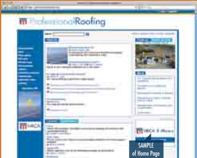
SAMPLE of Home Page Banner Ad 263x175