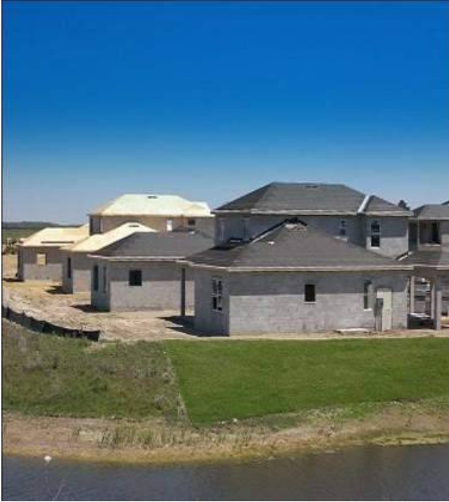
Figure 6. A typical new, residential construction work site.