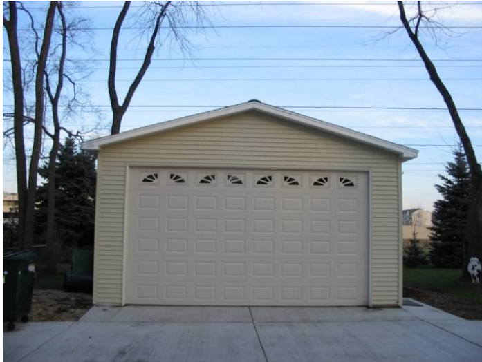
Figure 3. Garage with 4:12 pitched roof.

We acknowledge, Mr. Chairman, that like all things in life, safety monitors and slide guards are not fool-proof. But in those 15 years, my company has worked on thousands of homes and we have not had a single serious accident or injury resulting from a fall.