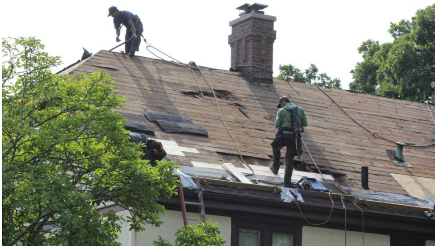
Figure 5. Workers in PFAs on a 10:12 pitched roof.

We also know that OSHA has more reports of fatal falls when personal fall arrest systems are used than when slide guards are used. And we know that the use of personal fall arrest systems introduces a whole host of greater hazards, most notably those resulting from tripping over ropes on the roof. On roofs 4:12 to 8:12 the ropes lay on the roof under your feet and are practically out of sight -- especially if the workers are carrying materials. However, once workers are on a roof with a slope greater than 8:12 the ropes now lay in front of the workers because of the roof's pitch (figure 5). So the slope is an important variable and why we agree that on these very steep roofs tying off is appropriate.