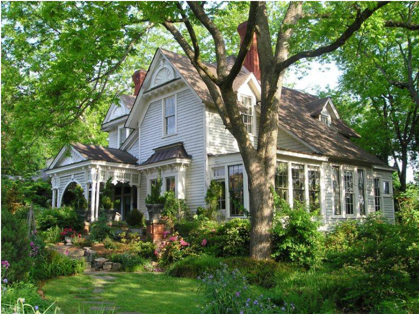
Figure 7. Site issues on a typical residential reroofing project.

Here's an example: We recently completed a very common type roof replacement on a ranch style house. Due to the existing landscaping, the only access for our dump truck was in the driveway, which is common when we are replacing a roof. We had to carry the shingle tear-off from the rear of the home up over the roof peak to the front of the home where our dump truck was located. As you can probably imagine with a five man crew, the ropes became