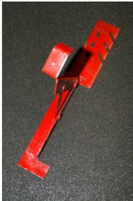
Figure 1. Typical slide guard bracket.