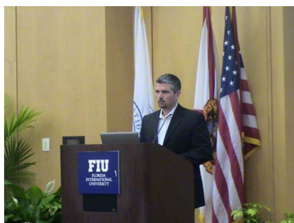
Figure 5. Wall the Wind Workshop held on January 30, 2009 (FIU, Miami, FL)