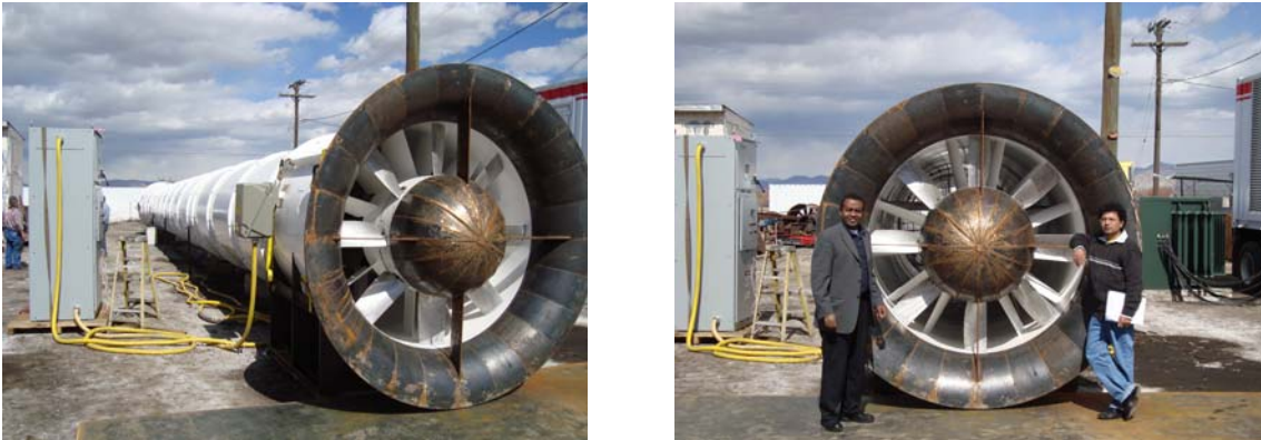
Figure 3. WoW electrical fan (picture taken at Grand Junction, Colorado)