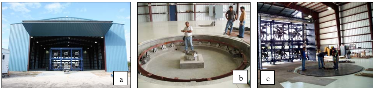
Figure 1. (a) WoW building, (b) WoW turntable pit, (c) WoW turntable